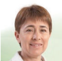
Berta Nunes Mayor of Alfandega da Fé