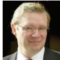
Nigel Crisp House of Lords, United Kingdom