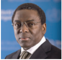
Luís Sambo Minister of Health in Angola. Professor at IHMT-UNL. WHO Regional Director Emeritus for Africa