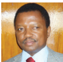
Mouzinho Saíde Deputy Health Minister, Mozambique