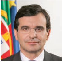
Adalberto Fernandes Minister of Health