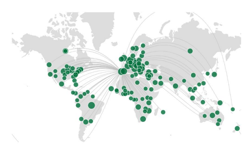
Figure 1 - 2020 GHTM/IHMT/NOVA External collaboration network on country level.

is a Unit of Universidade NOVA de Lisboa , with strong research, development and training components. IHMT/NOVA hosts 6 MSc and 7 PhD programs (<a href="http://www.ihmt.unl.pt/ensino-1/">http://www.ihmt.unl.pt/ensino-1/</a>) and currently has a total of 173 MSc and 137 PhD students, 56% of which are international students. IHMT/NOVA has been recognized at national and international level, for its scientific quality in postgraduate teaching and excellency in specific areas of research which are focused on tropical medicine, biomedical sciences and global health-related areas considered problematic. IHMT/NOVA has been at the forefront of research, training and development of these areas, often within networks and partnership projects, warranting an international global presence, with special emphasis on strong partnerships with Portuguese speaking countries in Africa, the Community of Portuguese Speaking Countries, America and Far East (Figure 1).